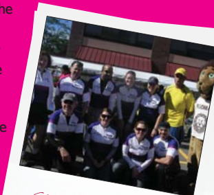
Go Team Big Sister!

October 4 was the perfect day for a leisurely 25, 50 or 100 mile bike ride around southeastern Massachusetts. The sun was shining, the sky was blue, and there was a hint of fall in the air that mixed nicely with the excitement of Team Big Sister as they geared up for this year's Rodman Ride for Kids.