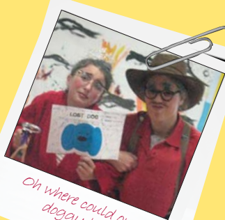
Oh where could our doggy be?

Big thanks are in order for Harvard Pilgrim Healthcare Foundation for sponsoring this year's party. With continued support from individuals, corporations, and foundations, we are able to not only make and support more quality matches, we can also offer them enjoyable no-cost activities such as this one. We look forward to seeing all our matches back again next year, and cannot wait to see those Little Sisters who are ready to be matched come back with a Big Sister of their own!