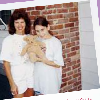
Displaying one of their many sewing projects