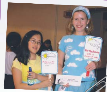
And the forecast for today is...

The day turned out to be a treat for all, particularly the 30 Little Sisters in attendance who are waiting to be matched and were able to experience the fun and laughter of having a Big Sister for a day. As we continue to engage more of Greater Boston's women and raise more money to support our gender-specific mentoring programs, our goal is to see all of these girls back again next year with a Big Sister of their own!