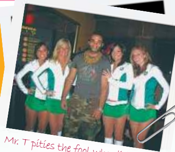
Mr. T pities the fool who didn't go to Wicked Big Pahty!