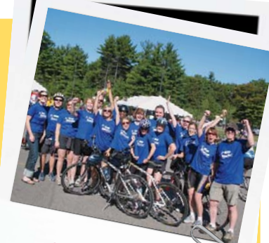
Go Team Big Sister!

We hope to see everyone again next year along with even more new faces who are willing to go the extra mile (or 25!) for Greater Boston's girls!