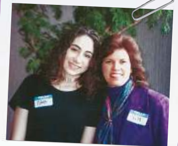
Attending a Big Sister Appreciation Breakfast