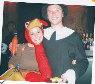
Even this unlikely pair can come together to support Big Sister

If you thought Wicked Big Pahty was a wicked good time, then save the date for our next Young Professional Group event, The Resolution Party, happening January 23, 2008!