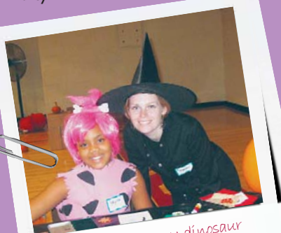
Have you seen my dinosaur around anywhere?