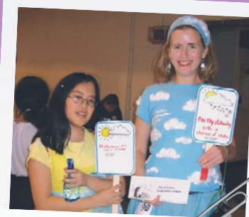
And the forecast for today is...

The day turned out to be a treat for all, particularly the 30 Little Sisters in attendance who are waiting to be matched and were able to experience the fun and laughter of having a Big Sister for a day. As we continue to engage more of Greater Boston's women and raise more money to support our gender-specific mentoring programs, our goal is to see all of these girls back again next year with a Big Sister of their own!