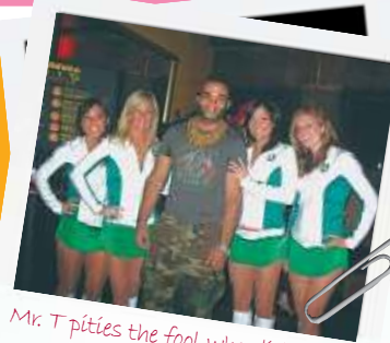
Mr. T pities the fool who didn't go to Wicked Big Pahty!