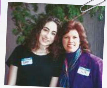
Attending a Big Sister Appreciation Breakfast