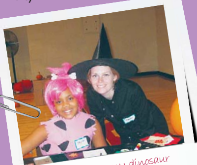
Have you seen my dinosaur around anywhere?