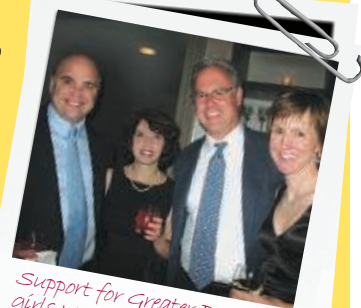
Support for Greater Boston's girls was on the menu at the Celebrity Chef Dinner