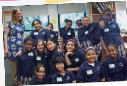
The Little Sisters of Mother Caroline Academy

going on to attend high school at such prestigious institutions as Boston Latin School and Buckingham Browne & Nichols.