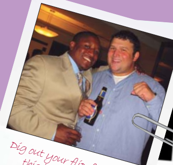
Dig out your flip-flops for this beachy affair!

NON-PROFIT U. S. POSTAGE PAID BOSTON-----MA PERMIT NO. 53202