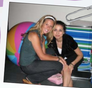
Get ready to celebrate summer...and Big Sister!