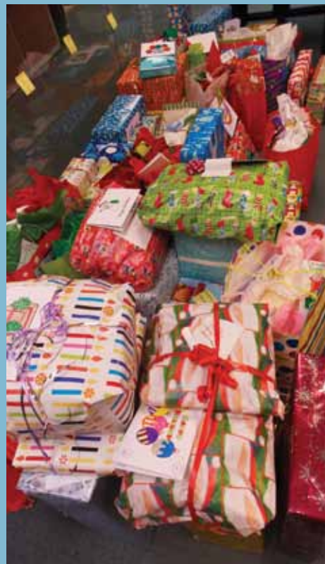
Our conference room quickly filled-up with brightly wrapped winter coats for our Little Sisters.